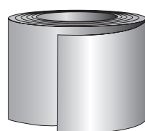
.032" GUTTER COIL